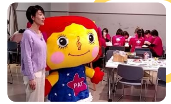
Festival’s Mascot Patty promoting the event