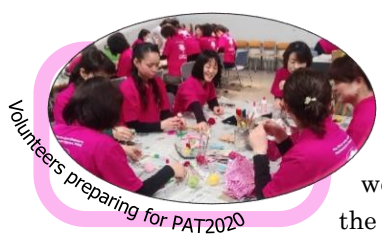
Volunteers preparing for PAT2020

In hopes that the pandemic will be settled by next summer, we are eagerly preparing to share the joy with children all over the world, through the performances by children and adults for children, and international cultural exchanges under the theme “ We build the future ”. This Festival aims to promote mutual cultural exchange and friendship among the participants through the artistic performances of various genres (theatre, dance, music, etc.) and various exchange activities like workshops, an excursion in Toyama Prefecture, exchange party, etc, to deepen the mutual understanding, friendship and to learn about each other’s culture. We believe that participants can fully enjoy their stay in Toyama.