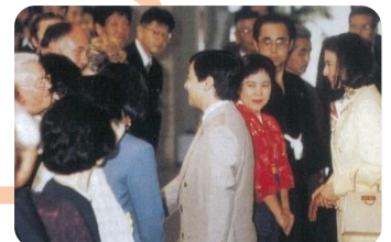
His Imperial Highness the Crown Prince with Her Imperial Highness (at that time) giving the honor to the festival.

In 2000, the Toyama World Children's Theatre Festival was held, officially being authorized by International Amateur Theatre Association (AITA/IATA asbl.). On this good occasion of organizing an international performing arts festival, we focused on children. Thus, after Asia-Pacific Children's Theatre Festival held in 2004, the first