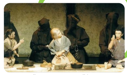
“Sannen Netaro” by Bungeiza and Griff Puppet Theatre

The results of our collaboration with overseas countries bore fruits of wonderful joint performances: folklore puppet drama “Sannen Netaro” created by BUNGEIZA and Griff Puppet Theatre (Hungary) and dance fantasy “The Little Match Girl” by KASAI Dancing Company and Bohemia Ballet (Czech Republic). Our